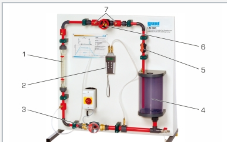
1 flow meter, 2 pressure meter, 3 pump, 4 tank, 5 valve for throttling, 6 diaphragm valve, 7 pressure measuring points