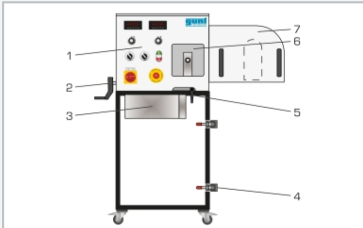
1 display and control elements, 2 spindle tensioning device for V-belt, 3 load resistor, 4 fastener, 5 clamping lever for tensioning device, 6 transparent maintenance flap, 7 protective hood for V-belt