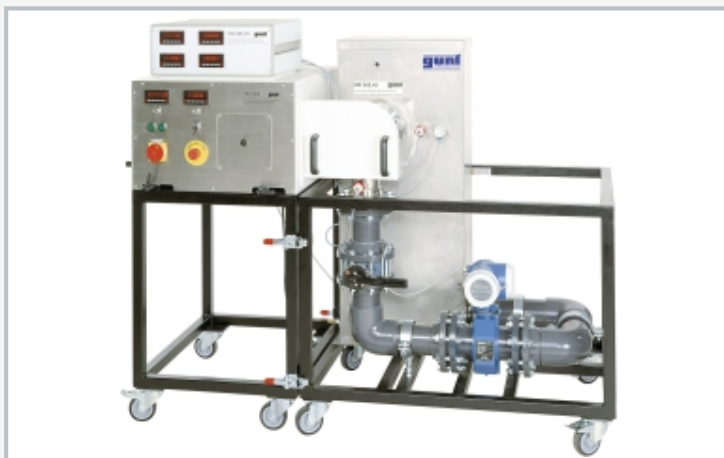
Example of a complete experimental setup: HM 365.45 axial-flow pump, connected to HM 365 universal drive and brake unit