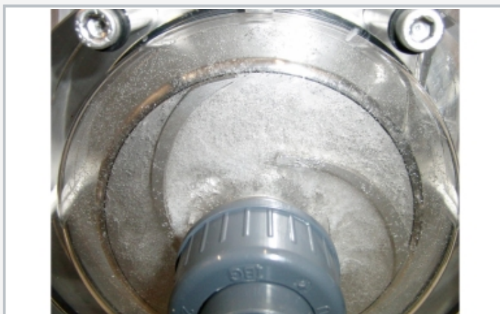
Formation of vapour bubbles due to cavitation at the pump impeller