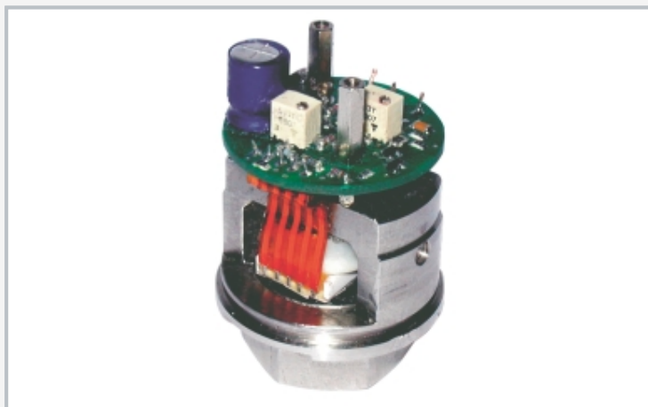
Interior layout of an electronic pressure sensor