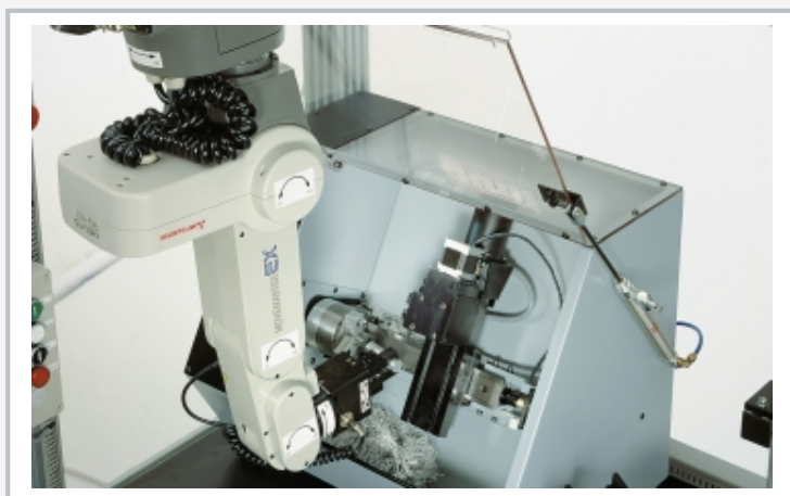
The illustration shows the robot removing a part from the lathe