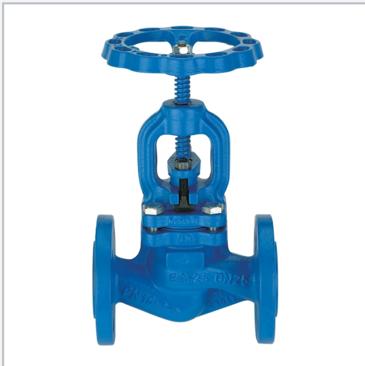
The illustration shows the shut-off valve fully assembled.