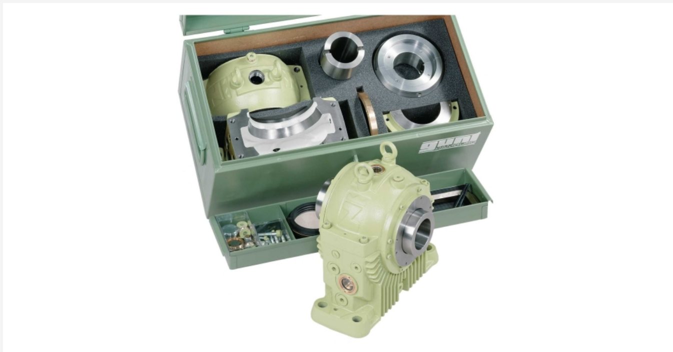
The illustration shows the tool box with kit and parts compartment insert. A fully assembled journal bearing is shown in the foreground.