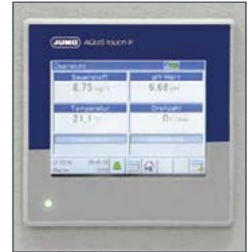
Digital process controller for displaying the process variables and for controlling the oxygen concentration