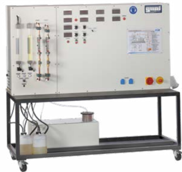
CT 300 Engine test stand, 11kW

The engines can be examined under full load or under partial load conditions. The characteristic diagram is determined with variable load and speed. The interaction of the brake and engine can also be examined in this context.