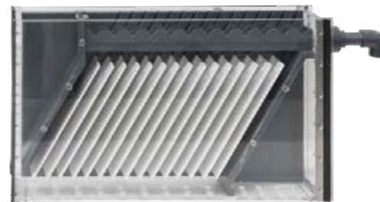
Optional lamella unit

The sedimentation process and the flow conditions can be observed very clearly thanks to the use of transparent materials and lighting.