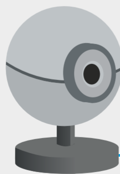
selected GUNT devices with USB connection